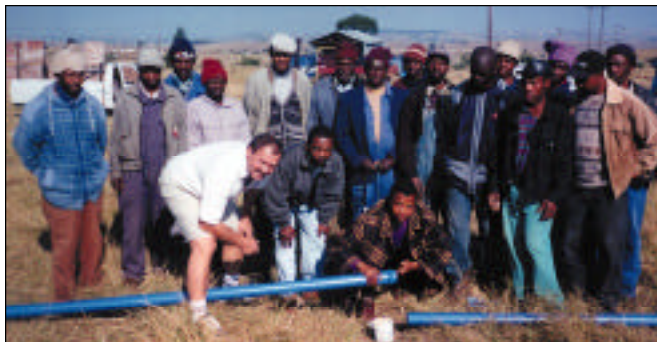
TANGA: DPI training persons from the local community (HDIs). Amanz'abantu supplied the pipes.

schemes (involving 50 projects), operators were trained by Amanz'abantu and are paid directly by the communities for their services. On the Peddie rural water supply scheme, the O&M company Masiphathisane Water Works, also a 100% HDC, is contracted by the Amatole District Municipality to provide the service.