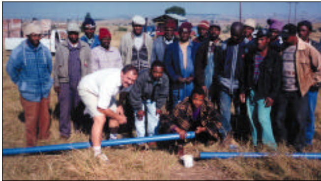
TANGA: DPI training persons from the local community (HDIs). Amanz'abantu supplied the pipes.

Ekunikezelweni kwe projekti amagunya oluntu asingathe iikonkono zamanzi ayi-100% HDCis agunyaziswe ngoomaspala benkqi- a ukuba baqhube imisebenzi yokugcina ezi projekti zisebenza. Kwi-El Nino Ground Water